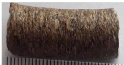
Figure 1. Example of RDF pellet.

The density analysis was tested by first running the Ultracyc 1200e instrument. The sample container is inserted into the cell and tightly closed, then click the sample on the Quantachrome pycWeb. After that, the running process is carried out by pressing the 1 button and then pressing the three buttons to start on the Quantachrome pycweb key. The Quantachrome Ultracyc instruments are the most precise tools available for determining the actual volume and density of powders, foams, and bulk solids. The tool will analyze the sample, and the results will come out when the analysis has been completed.