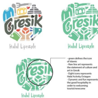
Figure 1. Design of Gresik Halal Lifestyle

From the previous research (Nastiti et al, 2017), it is formulated that Gresik city refers to Muslim activities or it will be identified as Halal Life Style City. Halal is something profitable and does not harm each other (Eka, 2010). In order to communicate and penetrate the branding, previous researched conducted by Nastiti, et al (2017) said that Gresik needs to create a campaign about its identity. Gresik is very preserving culture by containing profound spiritual and religious elements. This situation can be converted into a conservative artificial tourism (Aaker, 2011). To understand the results of the previous research, such as identity of Gresik Halal Life Style which can be seen in the following image.