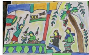
Fig 4. Religious Activities