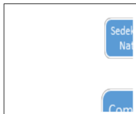
Fig 1. Concept of "Sedekah"

form of compensation or gifts to the surrounding community. They usually have done at the time of the company's birthdays and religious feasts. Activities undertaken by the company can be said to be the charity's excitement. The explanation of the TBL practices outlined by some of the above informants can be seen in the following