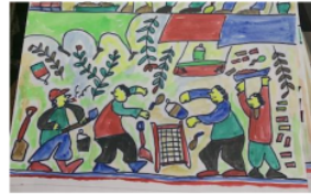
Fig 3. Gotong Royong

village that approached with the factory, did SEDEKAH the town. The synergy between the companies and surrounding villages shows that the company has already synergized to achieve harmonization. Furthermore, some images also show that the diversity of tribes and religions is one of the most important things to make a harmonization in the area. For that the storyline of "Damar Kurung" painting also shows it: