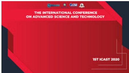
The 1st ICAST Virtual Background - Presenter Ok.jpeg 42K