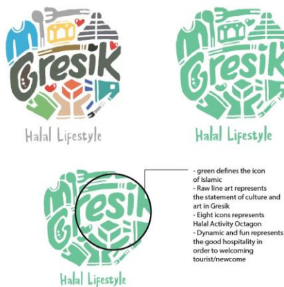
Figure 1. Design of Gresik Halal Lifestyle

From the previous research (Nastiti et al, 2017), it is formulated that Gresik city refers to Muslim activities or it will be identified as Halal Life Style City. Halal is something profitable and does not harm each other (Eka, 2010). In order to communicate and penetrate the branding, previous researched conducted by Nastiti, et al (2017) said that Gresik needs to create a campaign about its identity. Gresik is very preserving culture by containing profound spiritual and religious elements. This situation can be converted into a conservative artificial tourism (Aaker, 2011). To understand the results of the previous research, such as identity of Gresik Halal Life Style which can be seen in the following image.